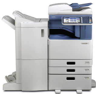
e-STUDIO3555c with Saddle-Stitch Finisher.