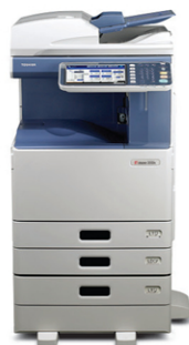
e-STUDIO3555c with Paper Feed Pedestal.