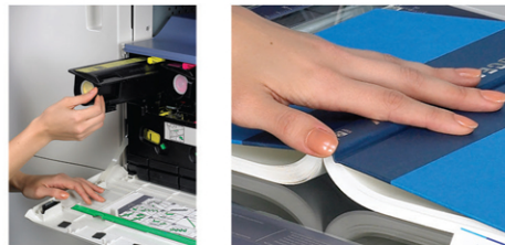
Print professional-looking, full-color newsletters and brochures using an optional saddle-stitch or staple finisher.