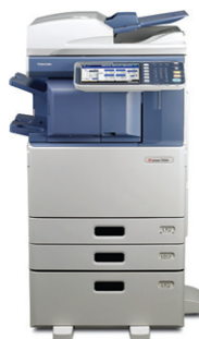
e-STUDIO3555c with Inner Finisher and LCF.